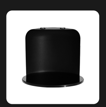
GemLightbox Pro Eclipse 1 pc