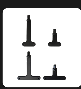
Black Earring Stands 4 pcs